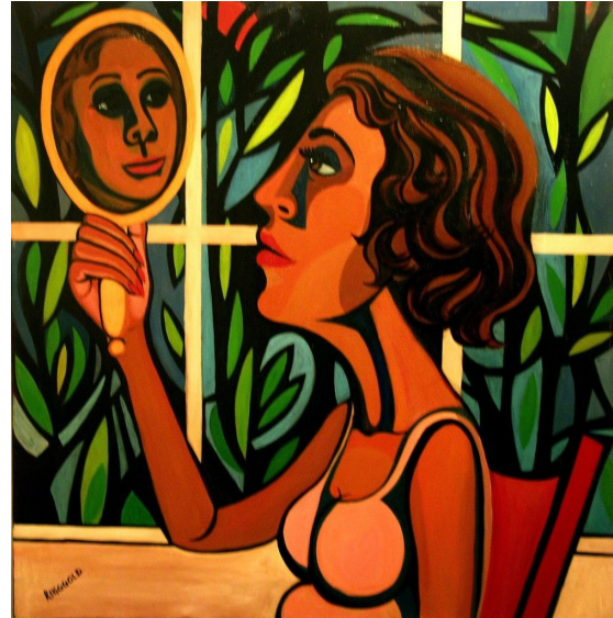
WOMAN LOOKING IN A MIRROR (1966)