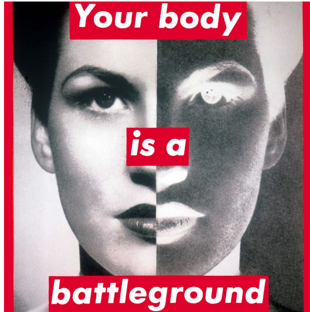
UNTITLED, (YOUR BODY IS A BATTLEGROUND), 1982